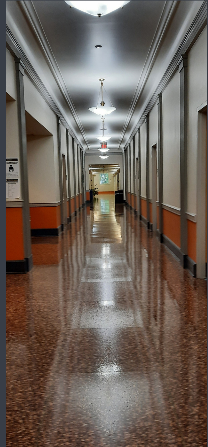
UNCG Stone Building